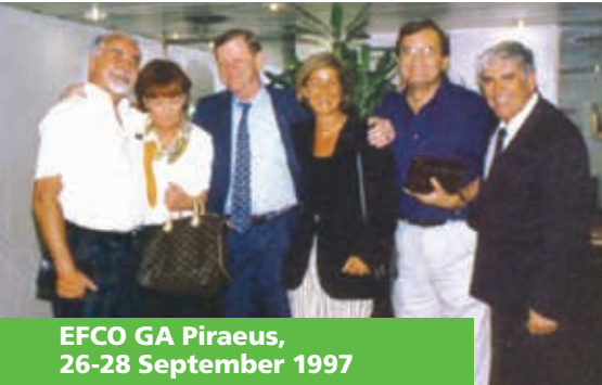
EFCO GA Piraeus, 26-28 September 1997