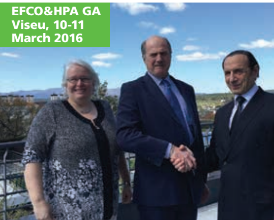
EFCO&HPA GA Viseu, 10-11 March 2016