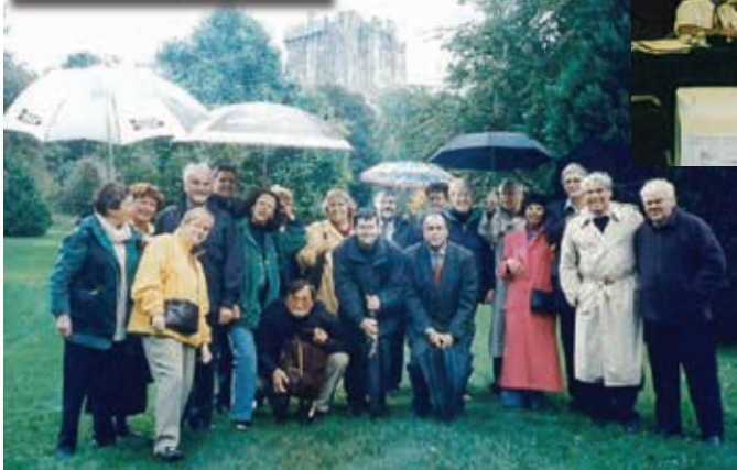
EFCO GA Cork, 30 September-1 October 1999

The classification schemes in member countries were reported in response to interest from the European Parliament in European Classification Schemes.