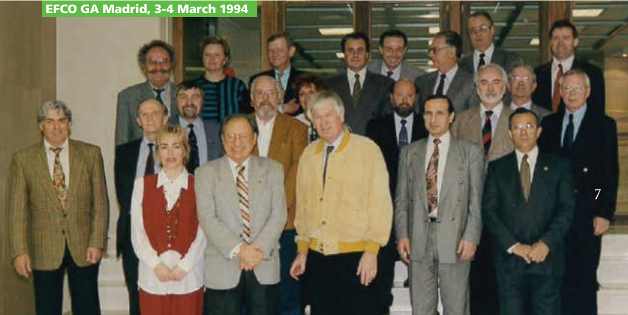
EFCO GA Madrid, 3-4 March 1994