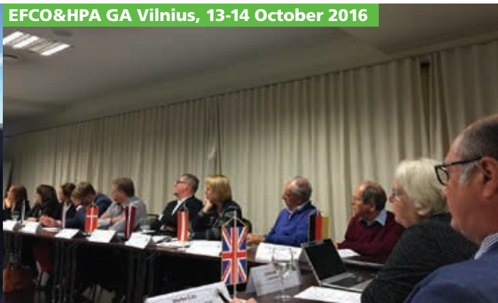
EFCO&HPA GA Vilnius, 13-14 October 2016