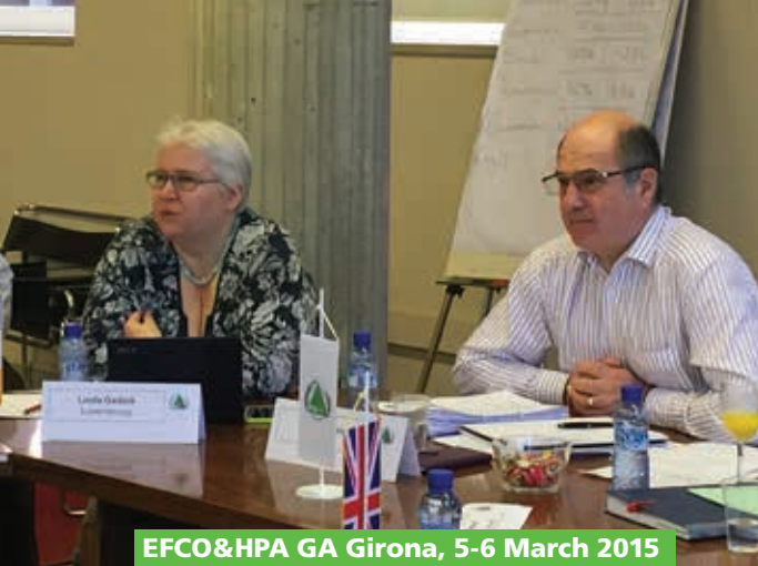
EFCO&HPA GA Girona, 5-6 March 2015

and legal (PESTEL) opportunities and threats to the industry. The meeting also heard that a new European Commissioner, Elżbieta Bieńkowska was now in post and had made a speech on Europe's priorities for tourism including improvements to the regulatory framework, promoting digital tourism, skills and seasonality, transport and a single voice for tourism. There appeared to be a renewed focus on tourism as a driver of economic growth, and it