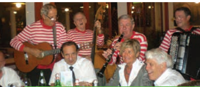
EFCO&HPA GA Venice, 22-23 September 2011

The autumn GA was held in La Rochelle. In the market reports, the UK reported that the Olympic Games held during the summer had not helped tourism. Lobby reports focused on VAT, the Package Travel Directive, and roadworthiness of caravans.