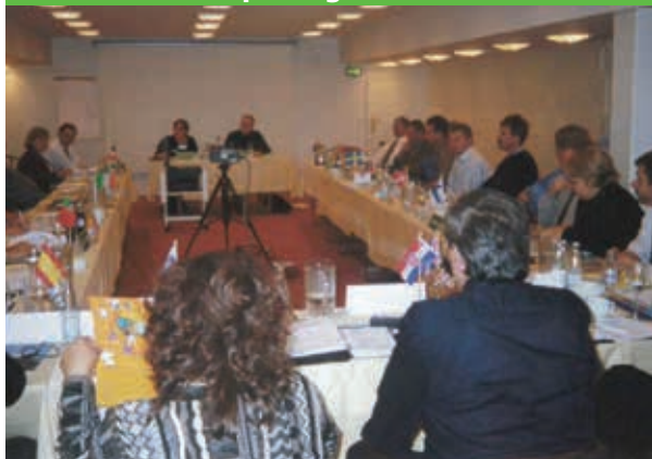
EFCO&HPA GA Bled, 25-26 September 2003