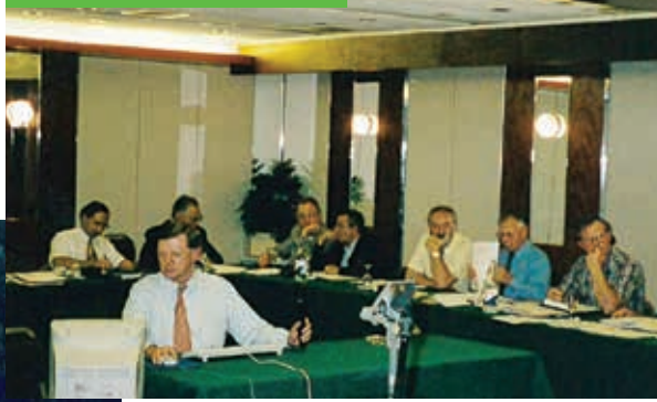
EFCO GA Cork, 30 September-1 October 1999