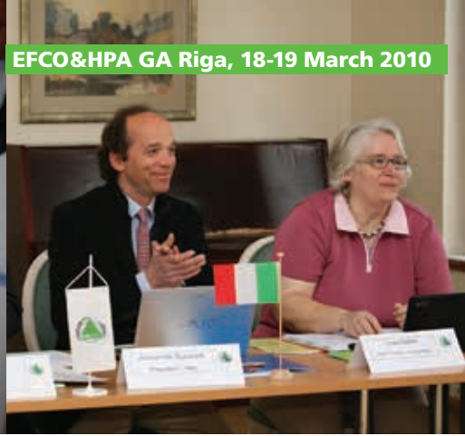
EFCO&HPA GA Riga, 18-19 March 2010