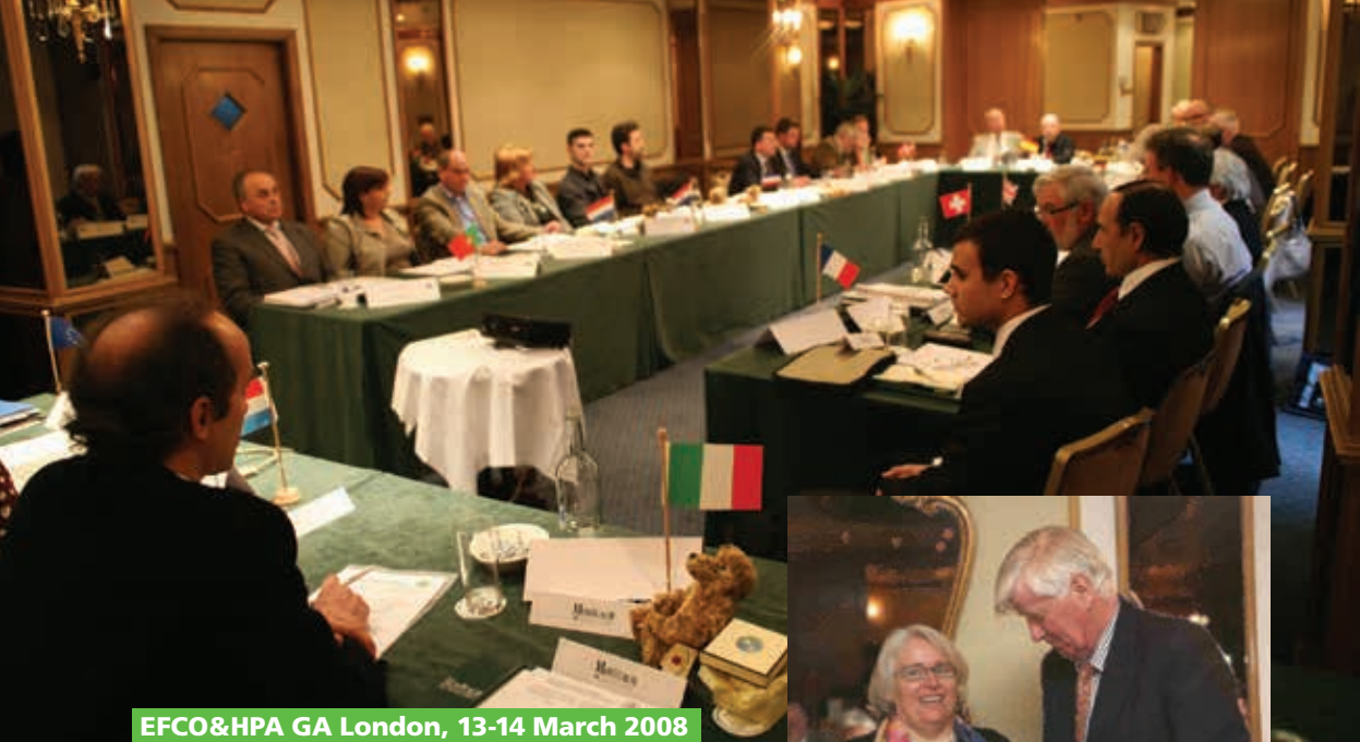
EFCO&HPA GA London, 13-14 March 2008