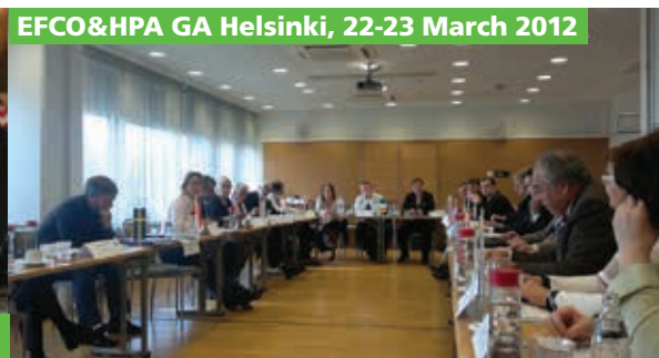
EFCO&HPA GA Helsinki, 22-23 March 2012