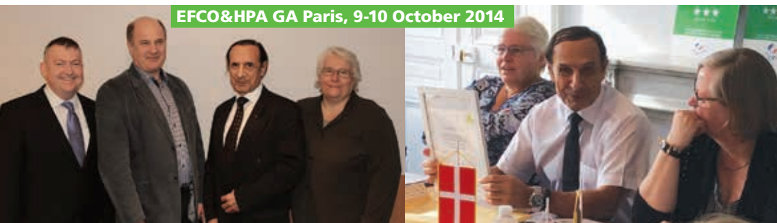
EFCO&HPA GA Paris, 9-10 October 2014

At the Girona GA in spring, a workshop was held where all members considered the future of the holiday parks industry , identifying political, economic, social, technological, environmental