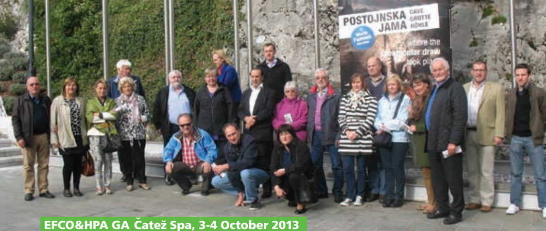
EFCO&HPA GA Čatež Spa, 3-4 October 2013