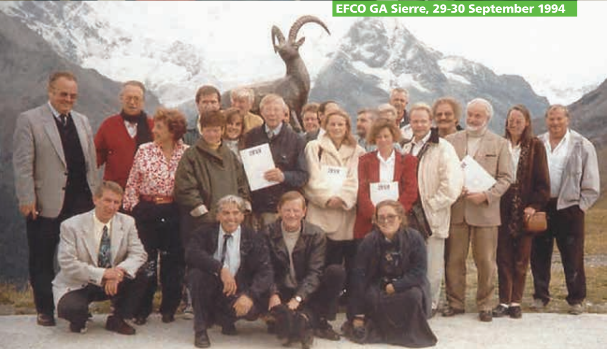
EFCO GA Sierre, 29-30 September 1994