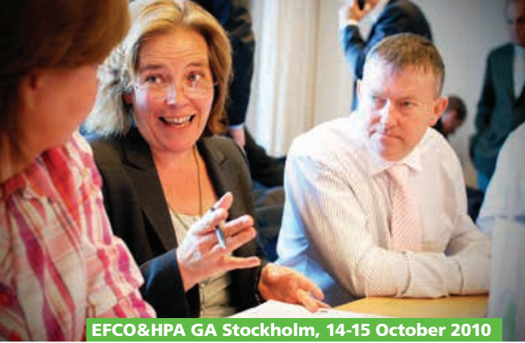
EFCO&HPA GA Stockholm, 14-15 October 2010