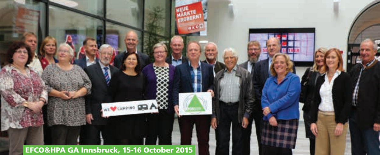
EFCO&HPA GA Innsbruck, 15-16 October 2015