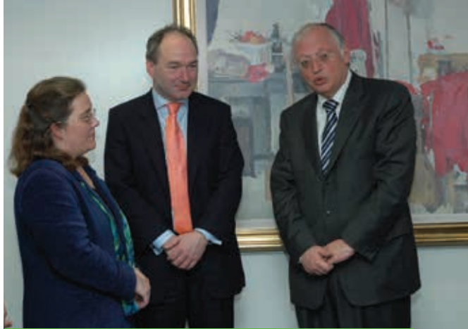
Meeting with Commissioner Verheugen, 2005