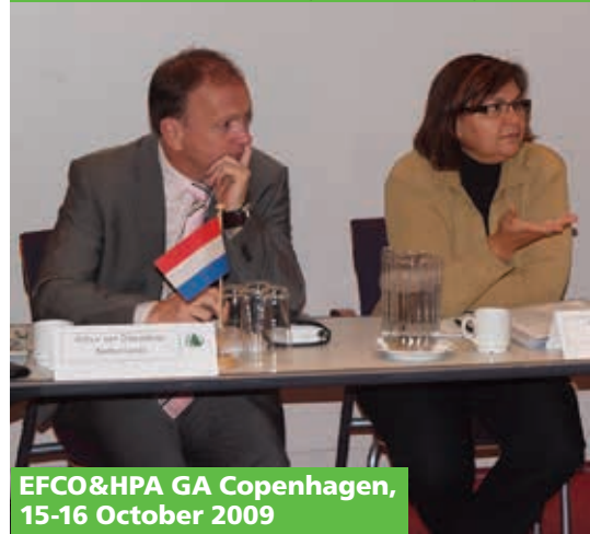
EFCO&HPA GA Copenhagen, 15-16 October 2009